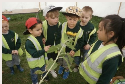
Trips and Visitors